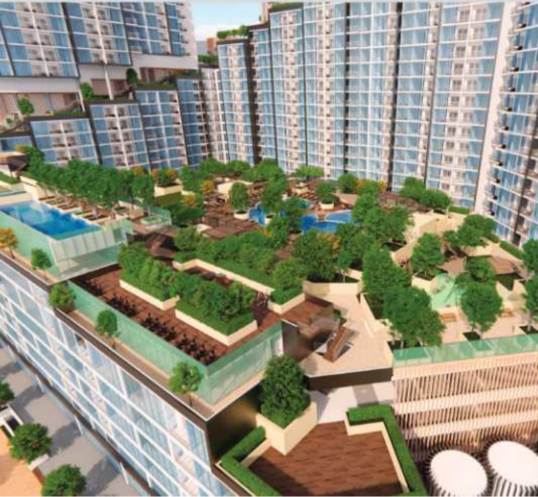
Landscaped Terraces at different levels with a host of amenities