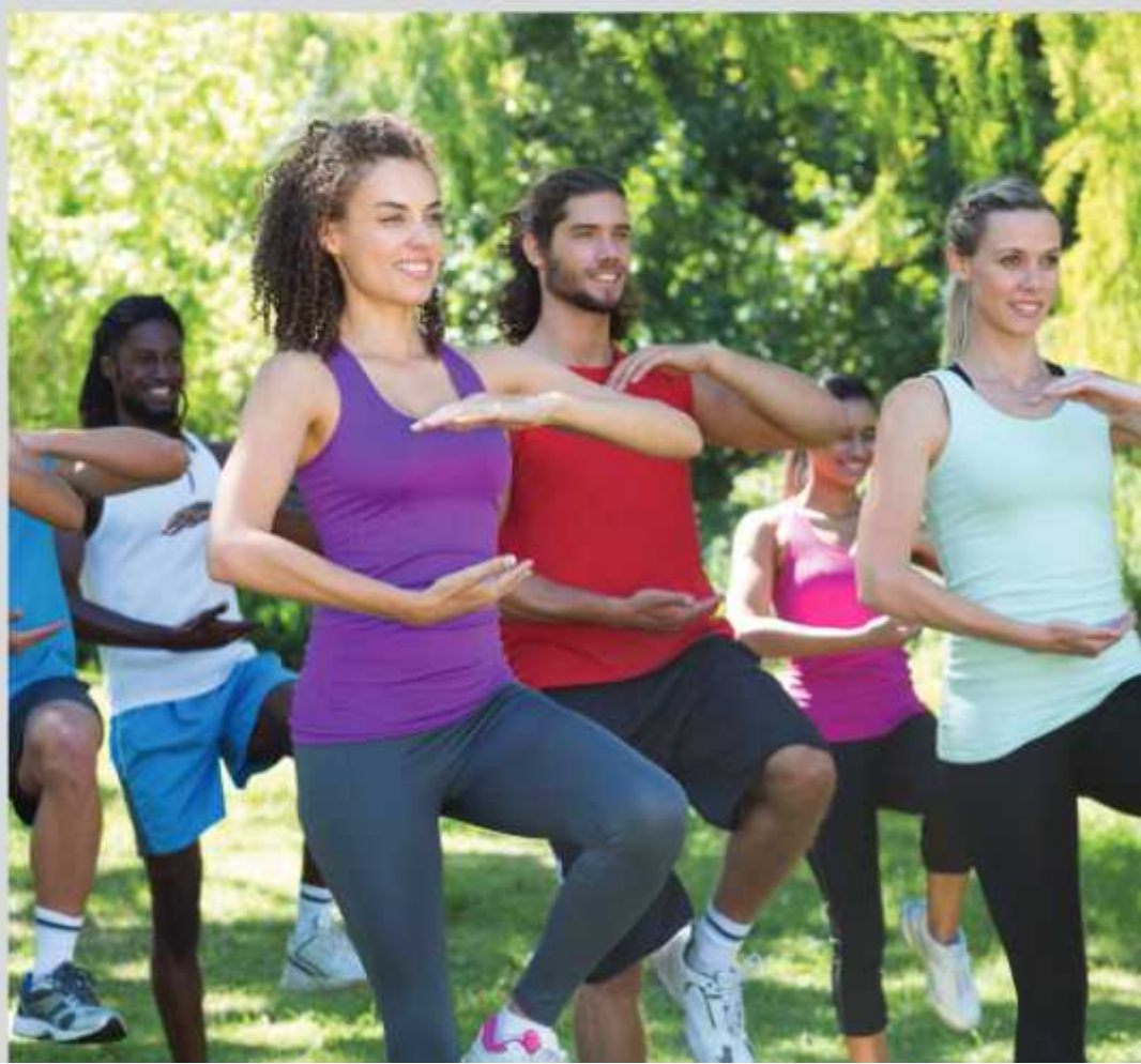
Tai Che Terrace