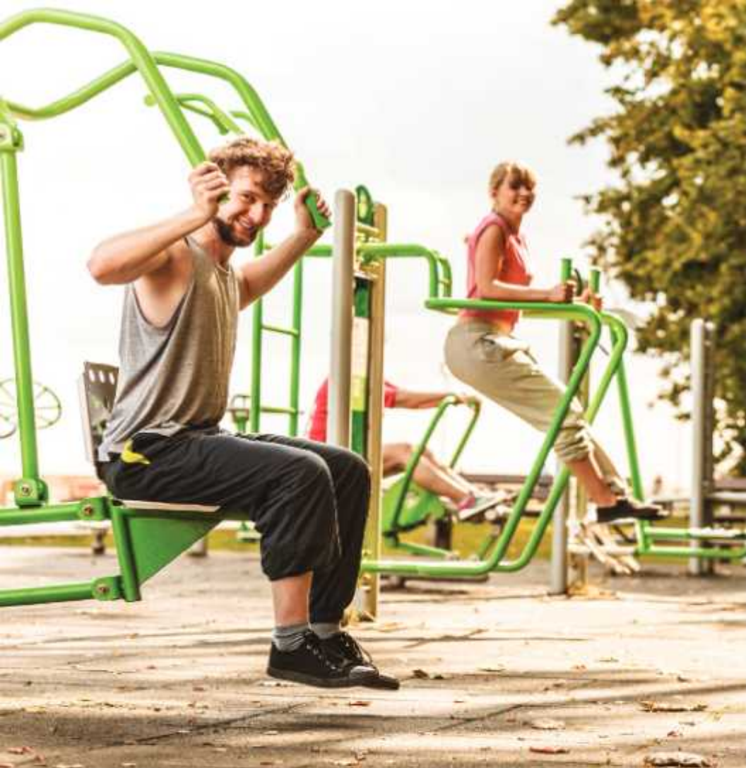
Outdoor Gym Terrace