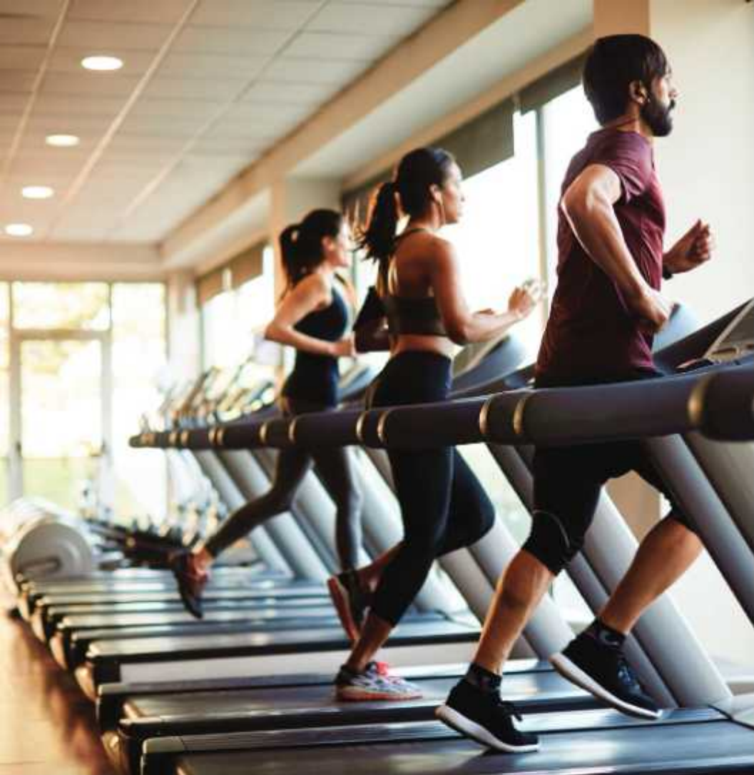
Health Club with changing rooms